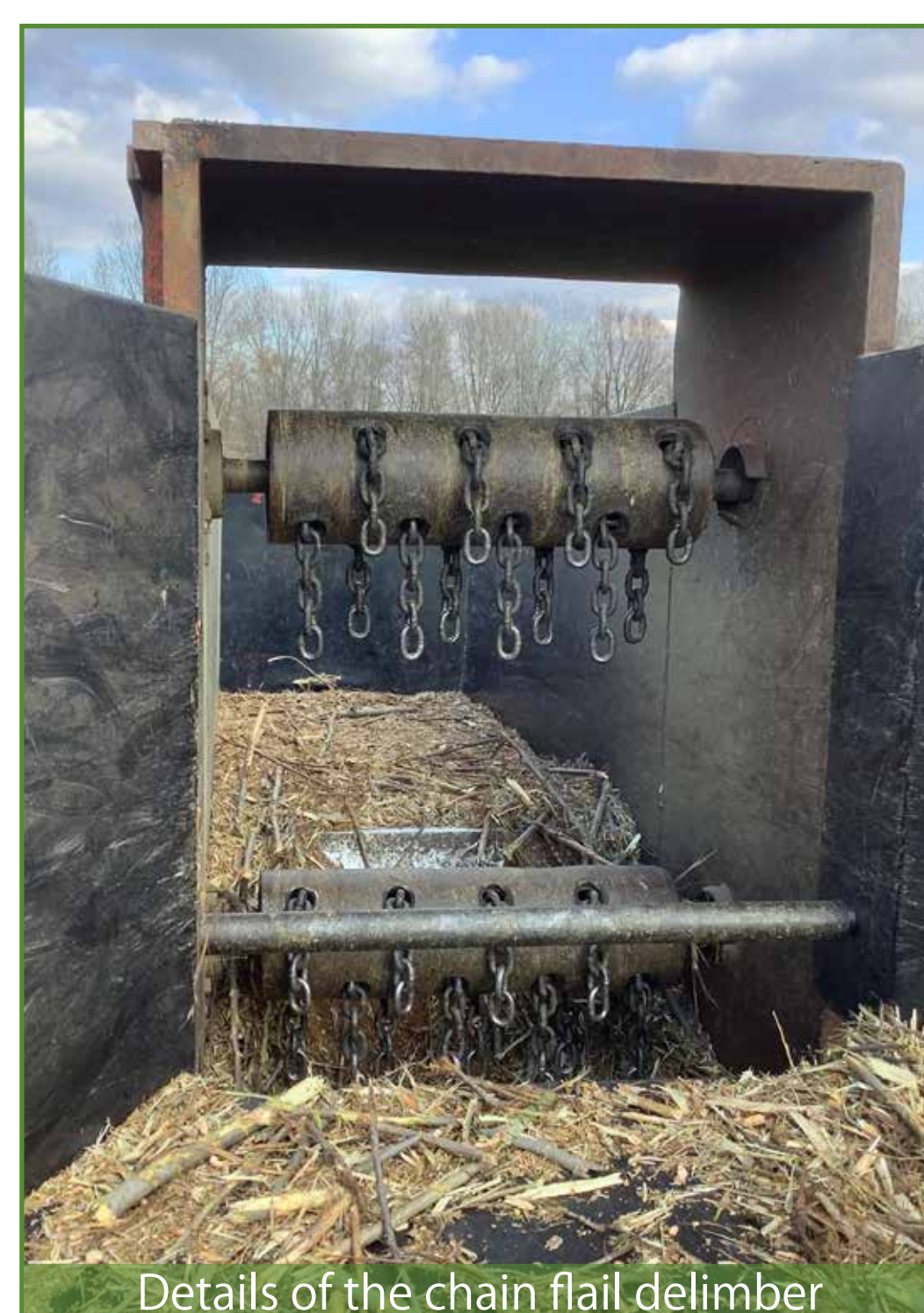
Details of the chain flail delimiter