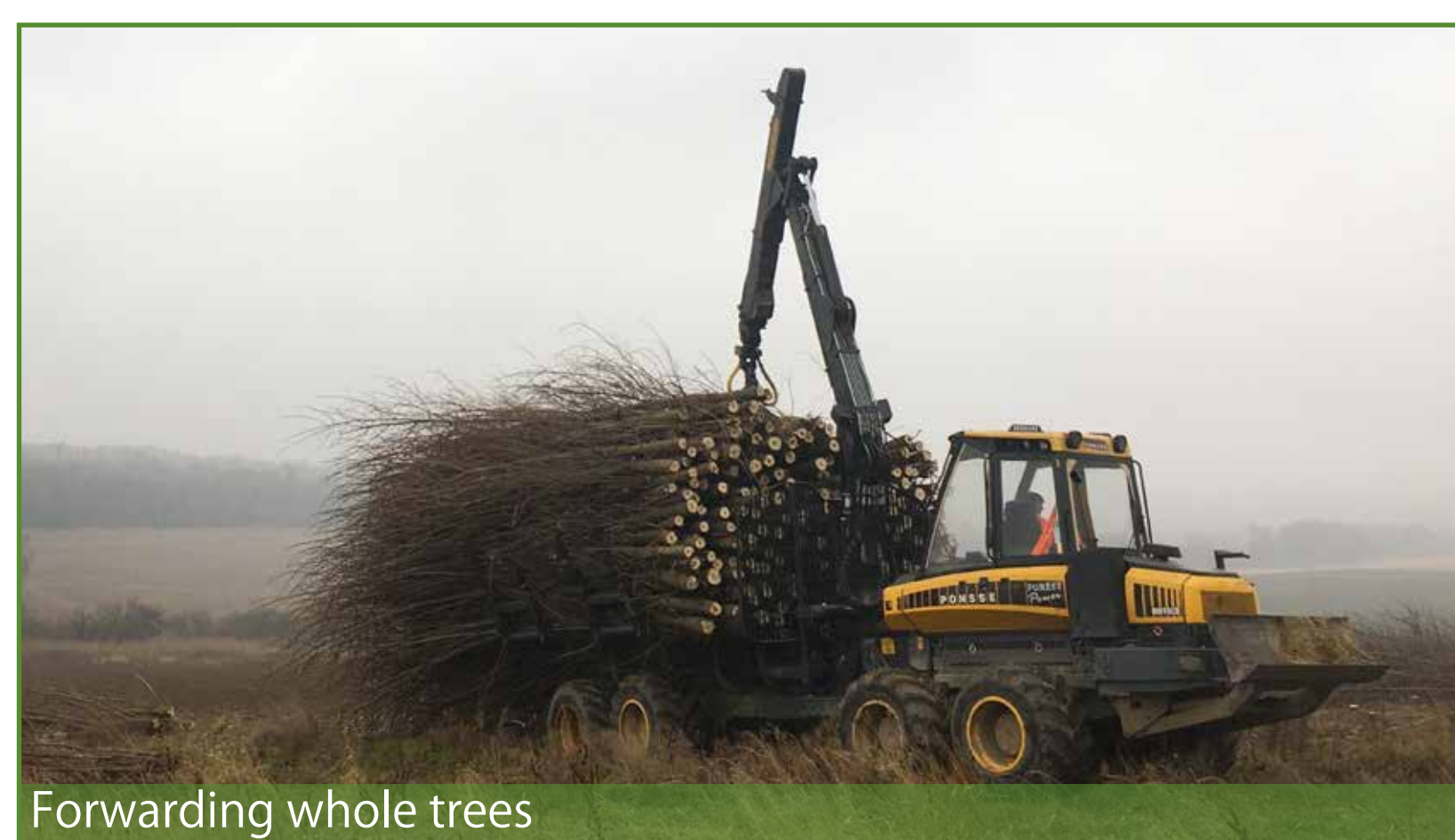
Forwarding whole trees