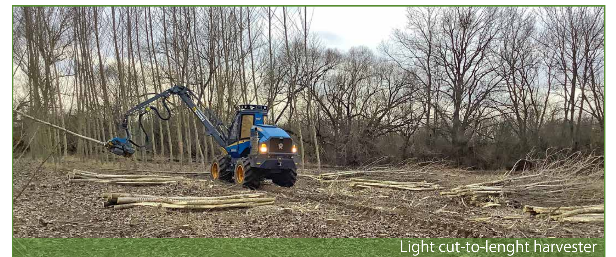
Light cut-to-length harvester