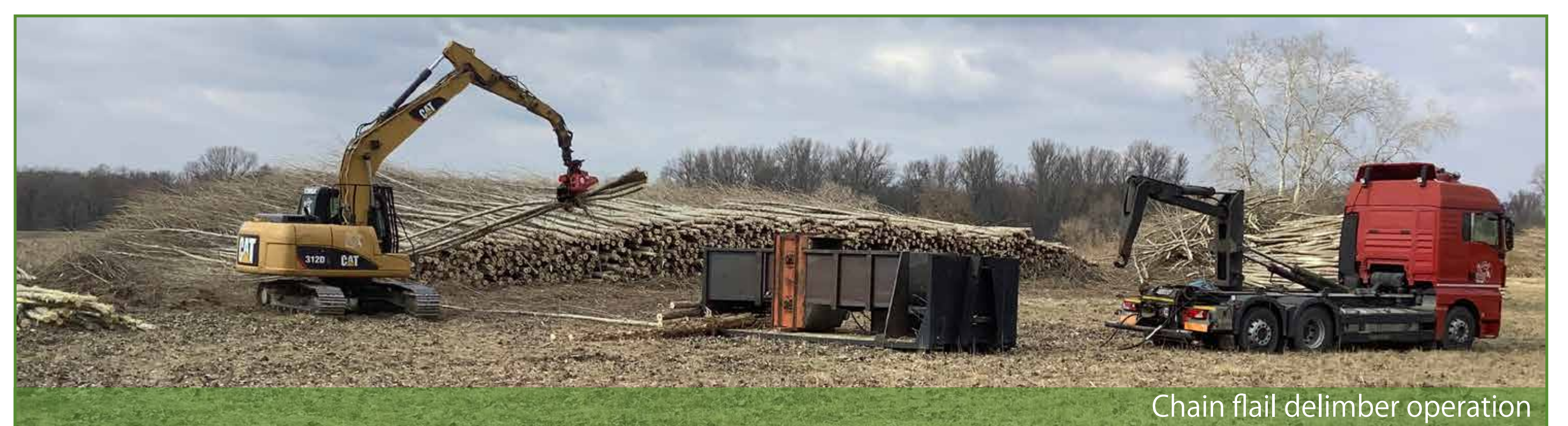
Chain flail delimitation operation