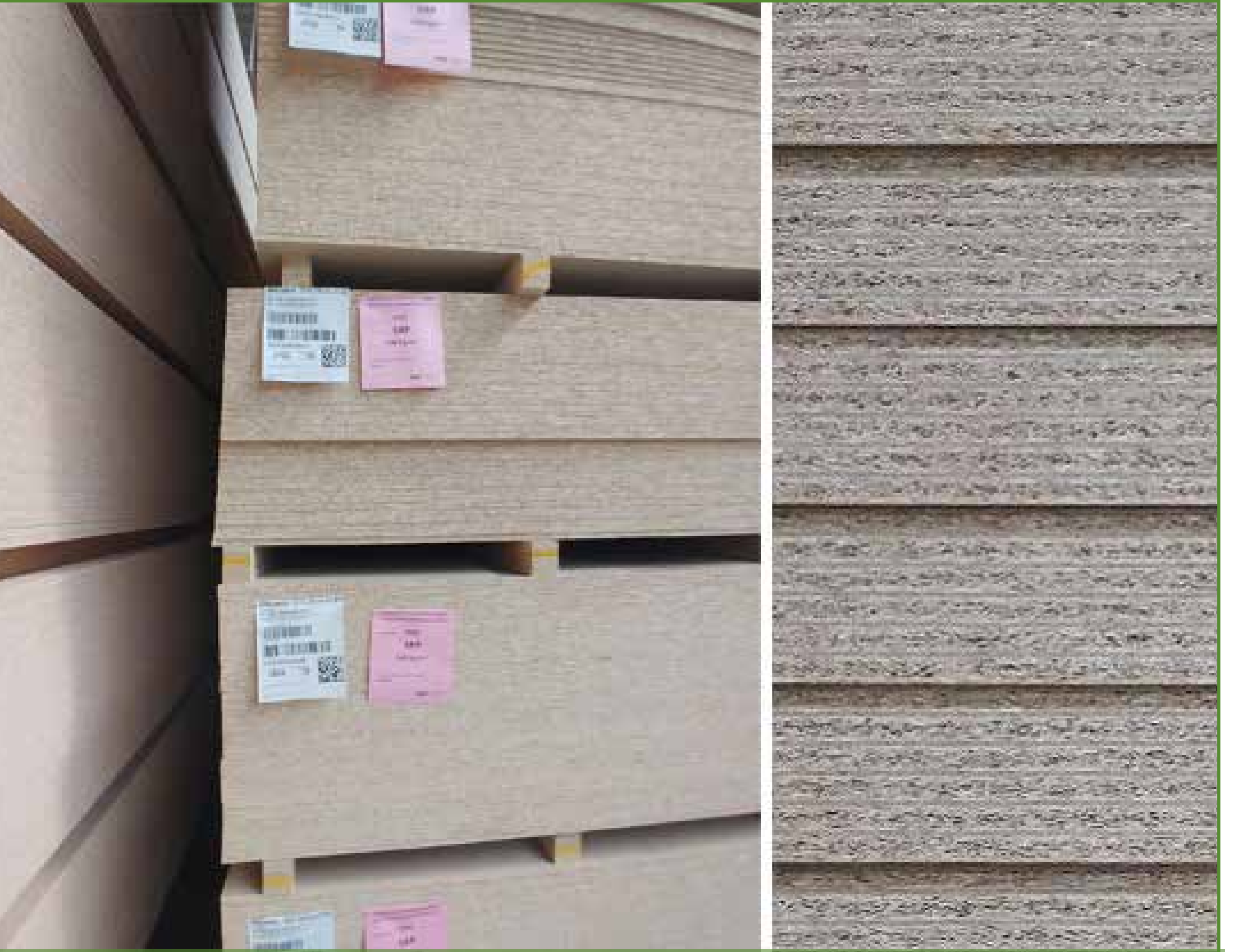
Fig.2: SRC poplar machinability test marked three densities; stacked FA LWB - visible

Our task was to develop a New Bio Based Material (NBBM) – the Functionally Adapted Light Weight Board (FA LWB) – by substituting conventional wood species such as pine with logs from local, close-to-factory fast growing poplar. This board – made from wood with up to 30% lower bulk density – can balance the volatility of the wood market prices and decrease the pressure on natural forests. Furthermore, we aimed to produce a board that is at least on par with its mechanical properties with the conventional boards and has a positive customer evaluation during use in furniture manufacturing.