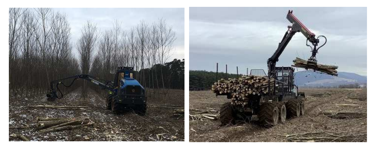
Figure 1. The harvester (left) and the forwarder (right) used for the experiment.

Harvesting was conducted according to the mechanized cut-to-length method, using the classic combination of a harvester and a forwarder. The same Rottne H8D harvester (125 kW, 10 t own weight, head EGS 406) and Logset 5F GT compact forwarder (140 kW, 15 t own weight, 12 t payload capacity) were deployed at both sites (Figure 1). Each machine had its own operator, who was a qualified forestry professional with significant experience with his machine and specific task. The operators were selected after observing more than a dozen contractors and excluding those operators that were not considered representative of the regional pool of professional drivers.