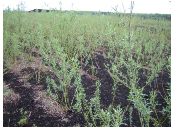
in top soil; Top right: Sewage sludge application to willow SRC fields in Sweden; Bottom left: Willow SRC fields located close to other agricultural crops; Bottom right: Landscape restoration and soil/wind erosion with willow SRC in peat fields.