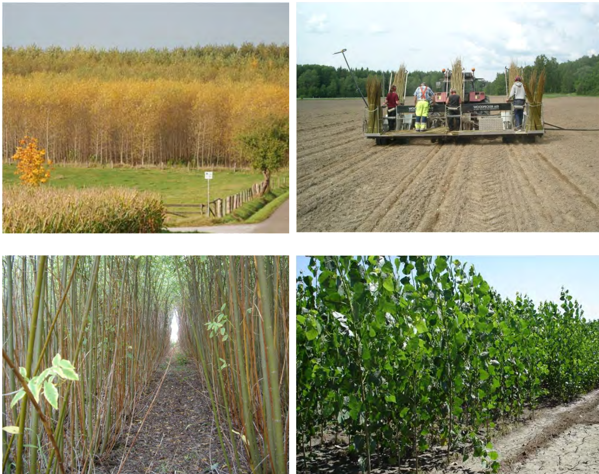
Figure 1. Pictures of SRC cultivation at different stages. Top left: SRC poplar field (Germany); Top right: Planting willow SRC (Sweden); Bottom left: Inside a willow SRC of two-year growth (Sweden); Bottom right: Poplar SRC field with one-year growth (Spain).