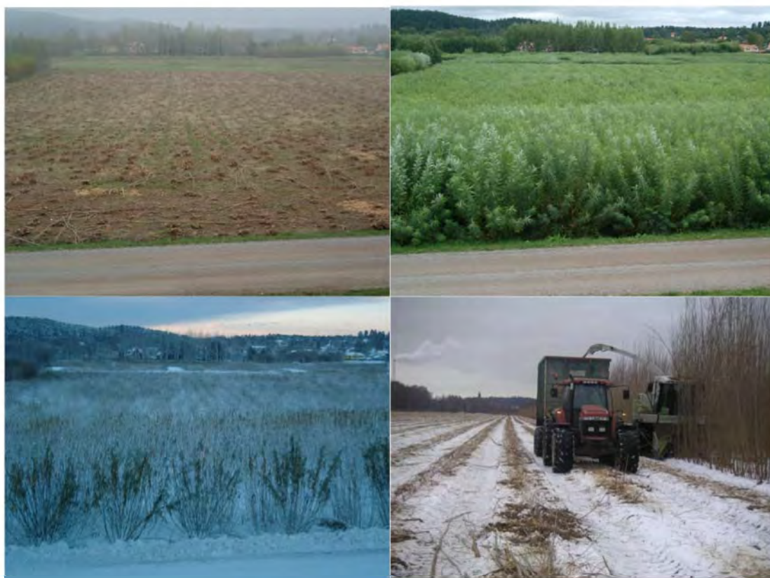
Figure 2. Different stages of willow SRC cultivation; harvested field; regrowth during the same year; after one growing season; harvest after 4 years. The first three pictures show the same SRC willow field (in Uppsala, Sweden).