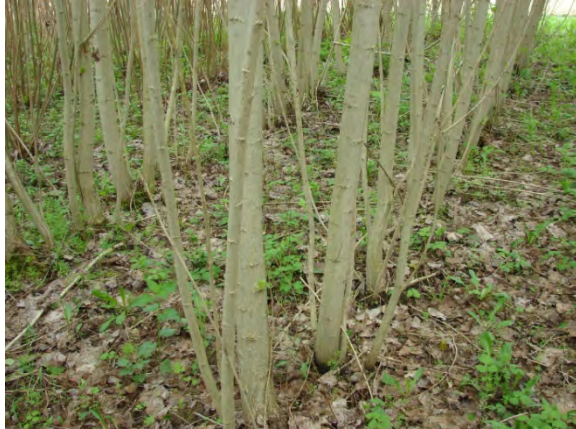
Figure 4. Top left: Poplar plantation (2-year old shoots on 16-year old roots) and accumulation of C