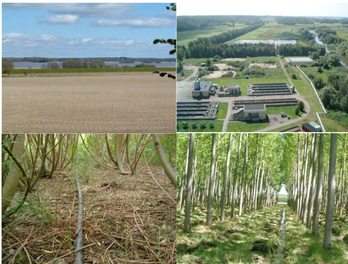
Figure 3. Pictures with SRC related to water issues. Top left: Willow SRC planted between agricultural land and water course as a buffer; Top right: The wastewater treatment plant in Enköping, Sweden, where wastewater is applied to a 76-ha willow SRC field as a step in the treatment; Bottom left: Drip irrigation pipes in the above-described field; Bottom right: Irrigated poplar plantation in Chile.

All the above about water quality and SRC indicate that when SRC replaces conventional agriculture crops, groundwater quality improvement is anticipated. In fact, several authors suggest the use of SRC in intensively managed agricultural areas to improve the current water quality and meet EU obligations in terms of water quality expressed in the Water Framework