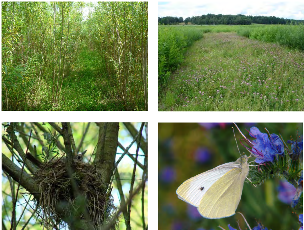
Figure 5. Top left: Vegetation in a willow SRC field in between a double row; Top right: Vegetation in between two sections of a willow SRC field; Bottom left: Nest of Turdus philomelos in willow SRC in Georgenhof, Germany; Bottom right: Pieris rapae on willow SRC at Jamikow, Germany, feeding on Echium vulgare .